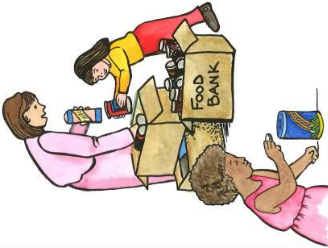
"Helping Hungry People" Following the Shepherd #1