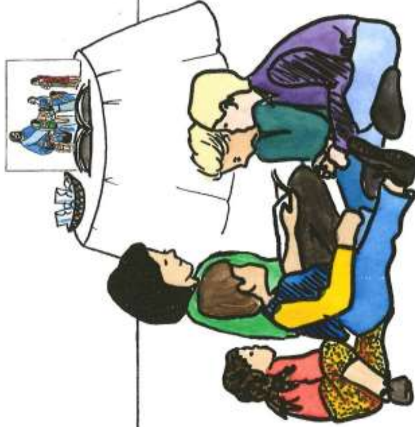
"Helping People Learn about God" Following the Shepherd #2